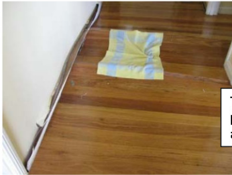
This inundated T&G floor over particleboard tented about 1 week after the water receded.

The flooring may continue to swell or expand across the boards for a period of time even after the water has subsided as moisture moves deeper into the timber. After cleaning, assess the extent of swelling and or tenting of boards (lifting off the supports). Check to see if there is still clearance between the edges of boards and the bottom plates of walls (usually under the skirting board) and to see if the flooring has expanded and started to push wall frames out at the bottom. If necessary relieve the pressure on walls by removing or cutting out perimeter boards. Eliminate any trip hazards that may have arisen due to tenting of boards or lifting of nails etc.