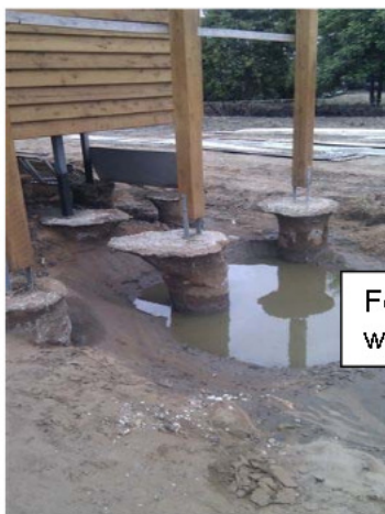
Footings scoured out by fast flowing water

NOTE: Where fast flowing water has impacted on the dwelling, joists and bearers may have shifted/twisted and walls and windows may be out of square etc. Any excessive misalignment should be corrected before new cladding or lining is installed.